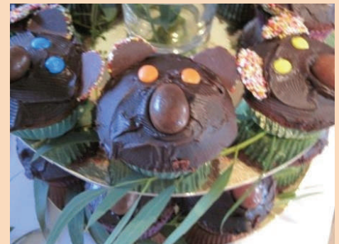
Algee koala (the MHFA mascot) birthday cakes!

VISIT www.mhfa.com.au FOR INFORMATION ON COURSES